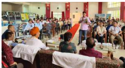
FPOs, farmers & CBBO interacted with Shri. Bhagirath Choudhary, Hon'ble Minister of State for Agriculture & Farmers Welfare, Govt. of India , during the interaction program

NABARD, CBBO (Clover Organic Pvt. Ltd.), FPOs, SHGs & Farmers and farm women.