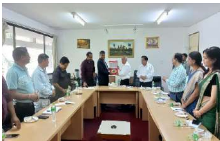
Felicitation of Hon'ble Vice Chancellor at School of Environment, Resources and Development (SERD), AIT, Bangkok

The visit provided a clear understanding to the team members regarding advanced electronics and IT applications in farm mechanization, genetic engineering, and ICT applications for dissemination and outreach programmes practiced at different academic and research institutions in Thailand.