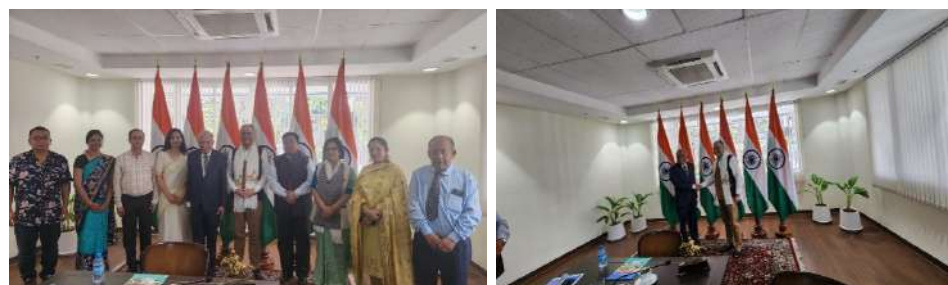
Hon'ble Vice Chancellor, CAU, Imphal, Manipur visited the Embassy of India, Bangkok, Thailand