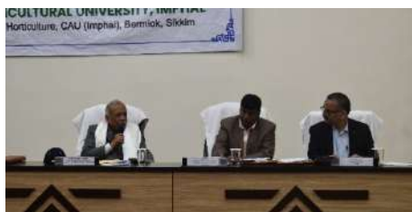
Fig.5: Hon'ble Vice Chancellor addressing during the 7 th Student Advisory Council Meeting