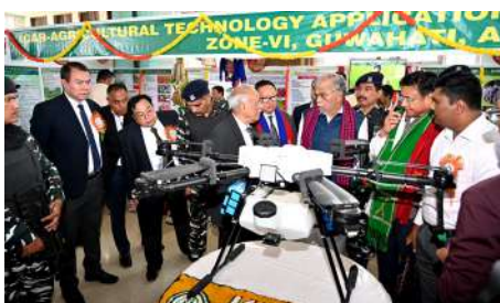
Inauguration and visit of exhibition stalls by chief Guest, Hon’ble Governor of Nagaland Shri La Ganesan, during CAU Regional Agri Fair 2023-24 held at State Agri Expo ground, 4 th Mile Chumoukedema, Dimapur, Nagaland.