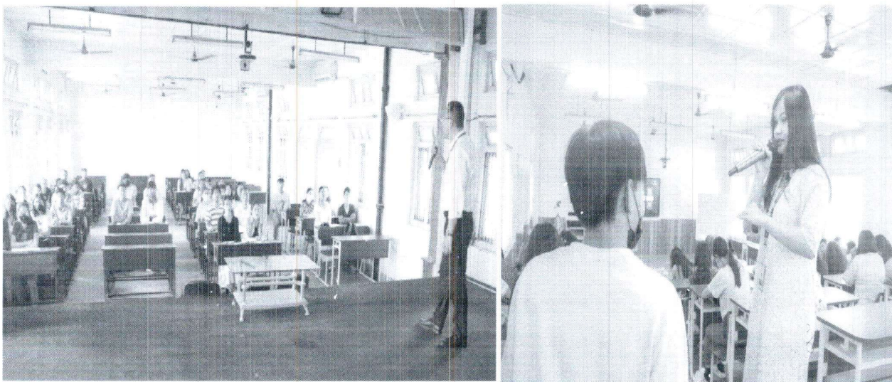
Photo: Snapshot of the programme “Assertiveness and Self-confidence”