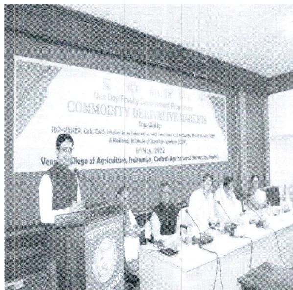
Photo: News paper report of the Programme; Snapshot of the programme