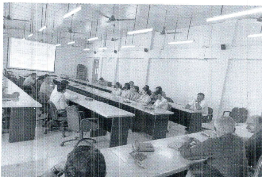
Photo: Faculty-students interactive session regarding the student foreign training at AIT, Bangkok