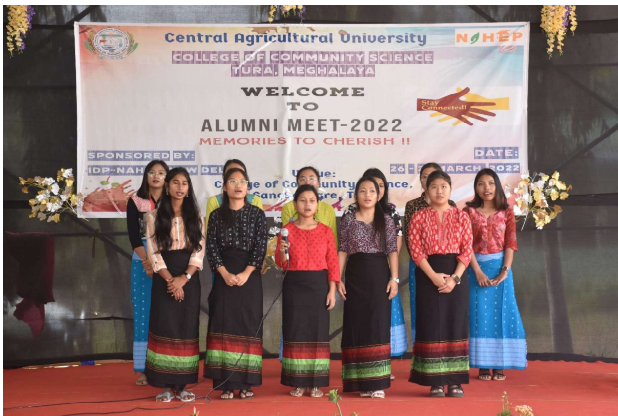
Photo: Opening song on College of Community Science, 1 st Alumni meet under IDP-NAHEP