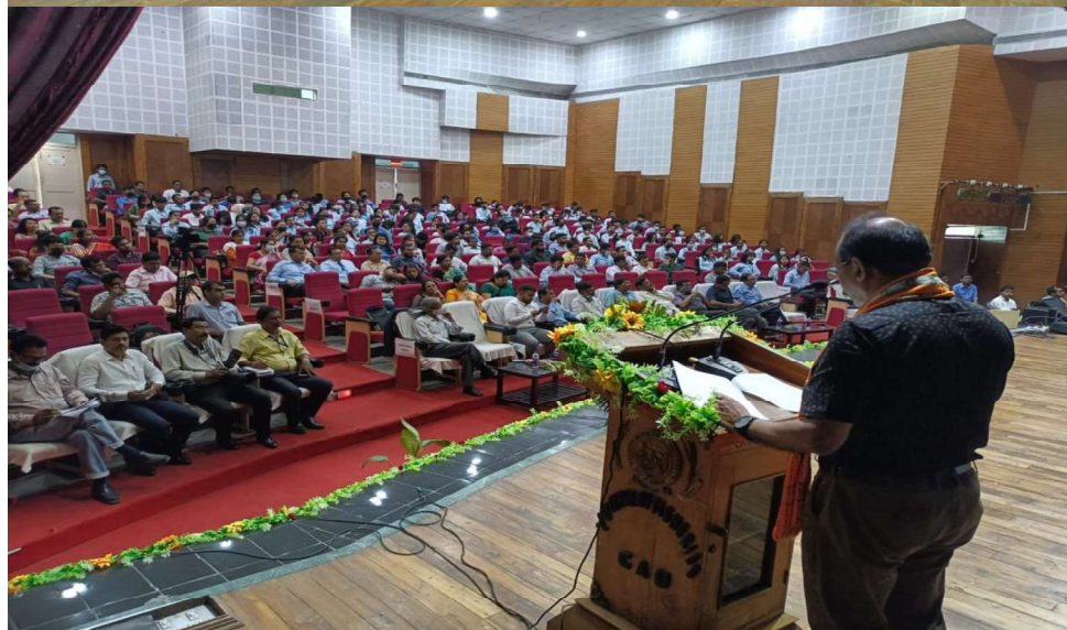
Photo: Alumni Meet at College of Fisheries, Iembucherra