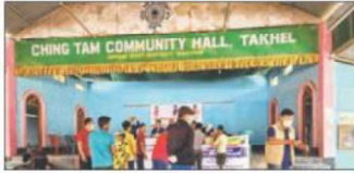
IMPHAL, Mar 27

Rotary Club of Imphal supported by Directorate of Veterinary Services and Animal Husbandry organised a 'Veterinary Aid Camp cum Mass Vaccination Programme' at Takhel village, RCC village, Imphal East District today.