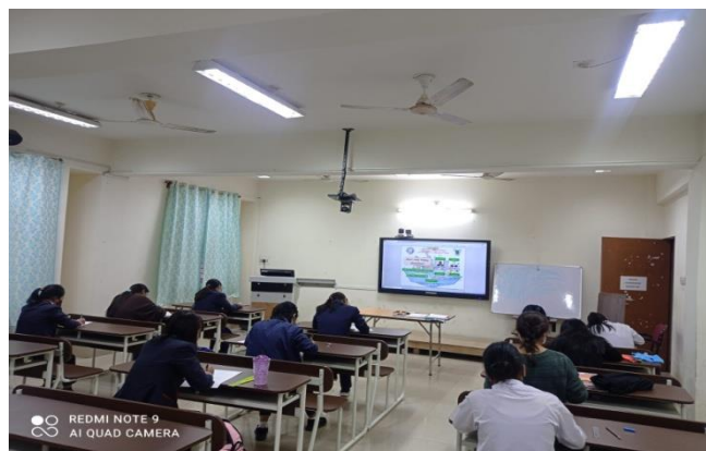
Photo: Short story writing competition at College of Community Science, Tura