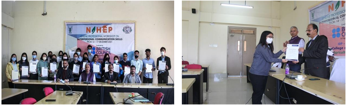
Photo: A valedictory programme of Online Professional Workshop on Interpersonal Communication Skills Conducted By British Council, India at the College of Fisheries