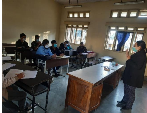
Photo: Photo taken during the Basics of writing skills class on 27 th December, 2021 at College of Agriculture, Iroisemba