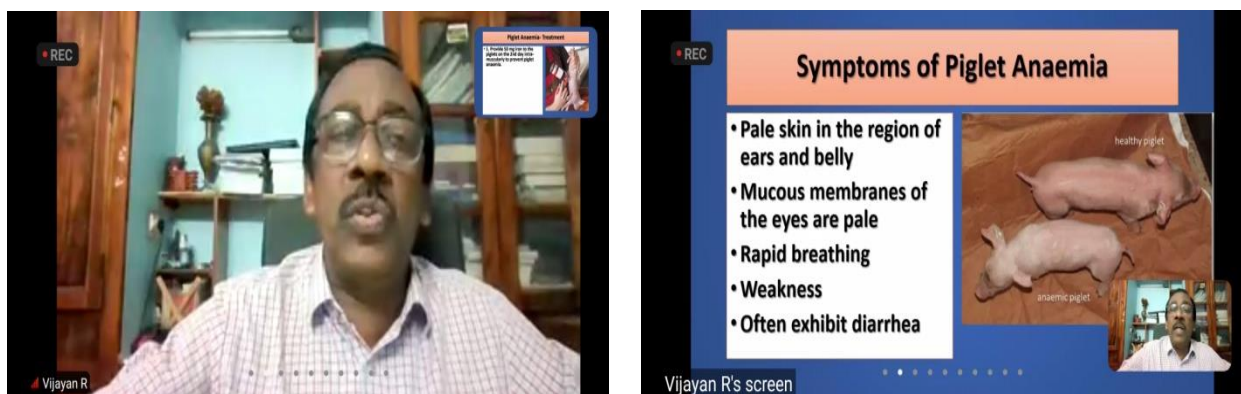
Photo: Screenshot of national training on “Treatment, Prevention and Control of Important Swine Diseases” at College of Veterinary Sciences & Animal husbandry, Selesih