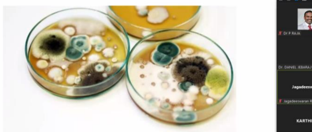
Photo: Screenshot of two days online National webinar on “Production of Fungal and Bacterial agents, a scope for budding startup” at College of Horticulture and Forestry, Pasighat