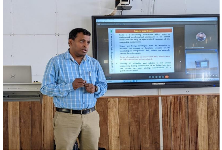
Photo: 6 days offline workshop on “Researchable ideas and methods: Improving competency of social scientist” conducted at College of Agriculture, Iroisemba, Imphal