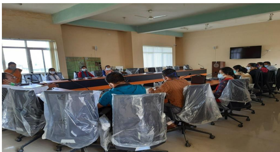
Photo: Utilization of incubation room, College of Agriculture, Iroisemba for farmer’s mobilization meeting and Agri Fair