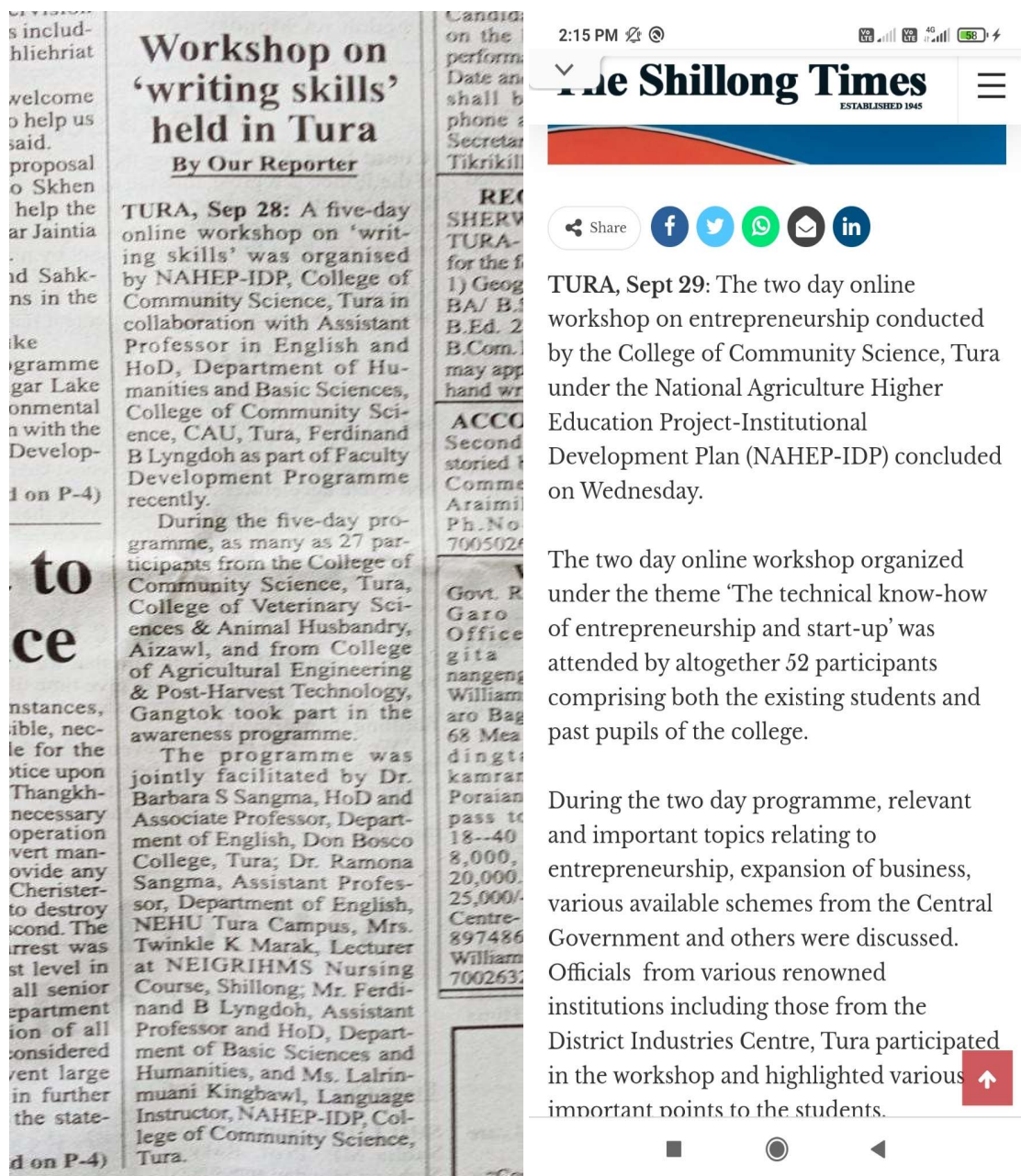
Photo: A newspaper clipping of the press release, featured in The Shillong Times, Tura, dated 28 th and 29 th September, 2021