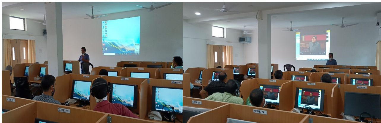
Photos: Demonstration of the Language Laboratory Software