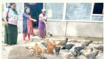
FLD on dual purpose Poultry breed Vanaraja