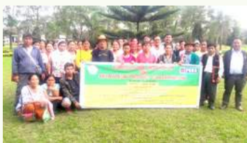
Agriculture Workshop on Petroleum conservation