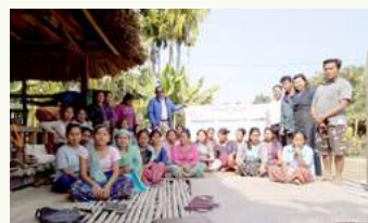
Training on Production Technology of Rabi Onion