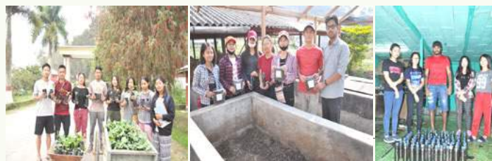
Nursery Seedlings for selling

The Students READY Programme/Experiential Learning Programme for the final year B. Sc. (Ag) students is currently going on under six(6) Departments viz., Horticulture, Soil science, Plant Pathology, Entomology, Agril. Engg. and Animal Sciences.