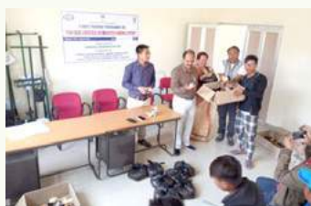
5 Day Training Programme on "Fish based Livestock Integrated farming System" during March 12-16, 2019 sponsorship by NABARD, Imphal centre