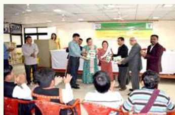
Vegetable seeds handed over to the Farmers