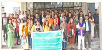
Inter State Training programme during Feb. 4 - 7, 2019