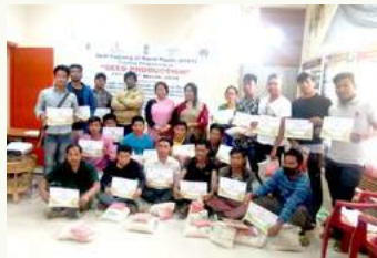
6 day Skill Training on "Seed Production" during March 11-16, 2019 under STRY