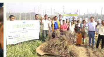
Farmers Field Day