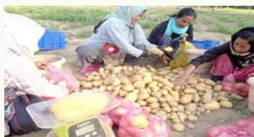
FLD on Potato var. Kufri Himani