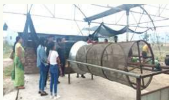
6 day Skill Training on "Vermiculture & Vermicomposting" during 14th to 19th March, 2019 under STRY