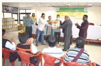
Light trap & Neem oil given to the Farmers