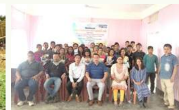
Workshop on PCRA