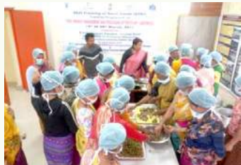
6 day Skill Training on "Post Harvest Management and Processing of Fruits & Vegetables" during March 15-20, 2019