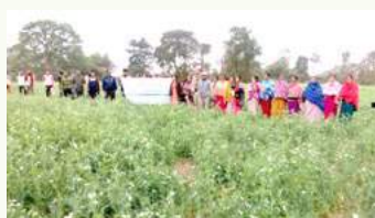
Field Day on Improved cultivation of Field pea var. Aman