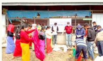
Skill Development Training Programme on "Small Poultry Farmer" during February 25-29, 2019