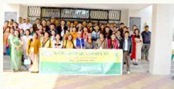
Rabi Krishak Sammelan on Feb. 6, 2019