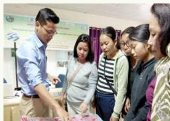
Demonstration of Fish Freshness during Skill training on "Post Harvest Activities of Fish Handling and Processing of Fishes"