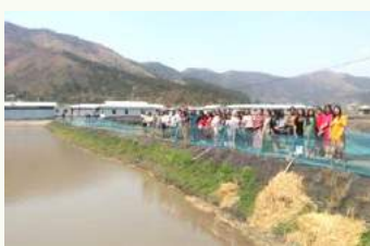
4 day Capacity Building Training Programme on "IFS and Value Chain Management for Upliftment of Rural Economy and Livelihood" during March 26-29, 2019