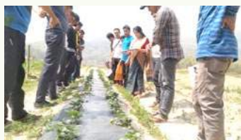
STRY participants of "Seed Production Programme" visiting different demonstrations at CAU, Research Farm, Andro