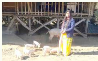
Introduction of Large White Yorkshire cross breed Pig at Napit village