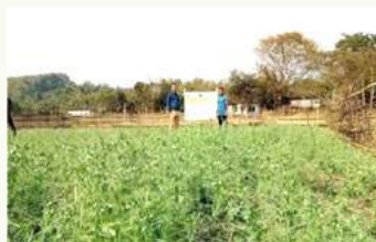
FLD on Zero tillage pea in rice fallow