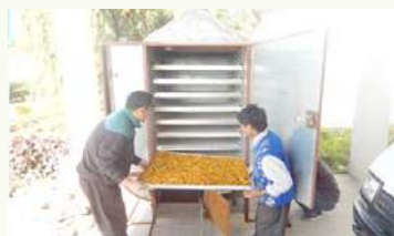
Training on Biomass Heat Generated Dryer