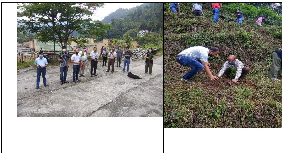
Photo: Celebration of world environment day by planting sapling of Orange at College campus (50 nos.)