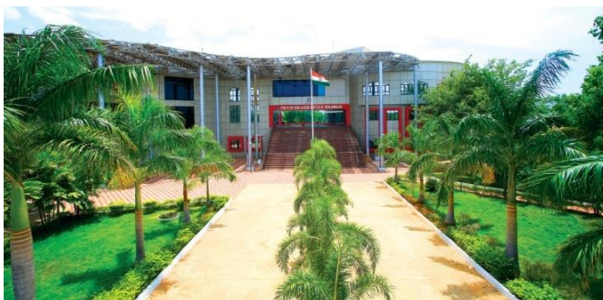
College of Agriculture, CAU, Imphal

processing, value addition, preservation, storage, packaging & other related fields. IIFPT Liaison Office Guwahati offers training, business incubation, consultancy, internship & food testing services to various stakeholders working in the food processing sector.